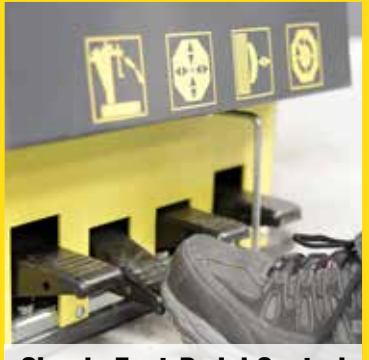
Simple Foot-Pedal Control