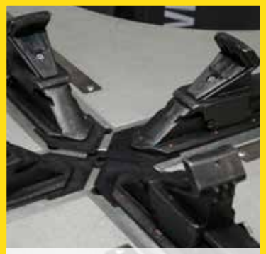
Advanced Clamp Positioning