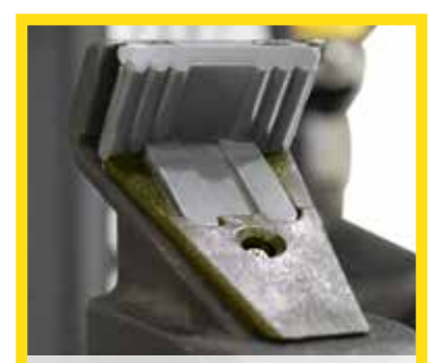
Polymer & Urethane RimGuard<sup>™</sup> Wheel Clamps

Ranger tire changers feature the renowned TurboBlast<sup>™</sup> bead seating system that blasts a powerful air burst between the tire and rim to help seat stubborn beads fast. A durable, non-marring nylon discharge barrel features a contoured tab that locks securely on the edge of the rim for better control during air discharge between the tire and wheel. A welded-steel, eight-gallon surge tank is larger than competitive models for all the inflation power you need, when you need it.