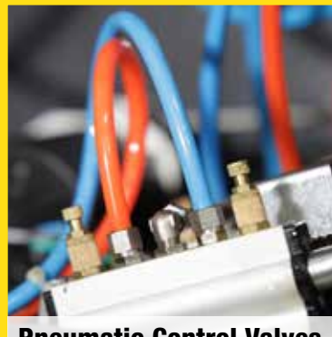
Pneumatic Control Valves