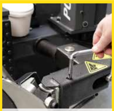
Adjustable Bead Breaker