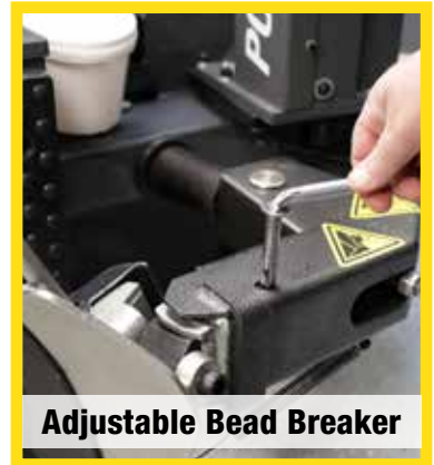
Adjustable Bead Breaker