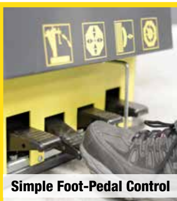
Simple Foot-Pedal Control

Industrial-grade, 45-micron pneumatic control valves feature die cast and machined bodies constructed from zinc and aluminum. High-performance polyurethane seals and self-lubricating, Teflon® piston guides provide increased service life and performance at the highest level possible within almost every imaginable working condition. Valve plungers feature muffled extrication ports that direct any dirt or contamination accumulated on the outside perimeter of the spool to be automatically blown away each time the valve goes into the release position.