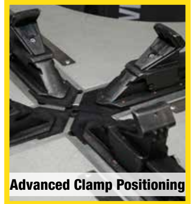
Advanced Clamp Positioning