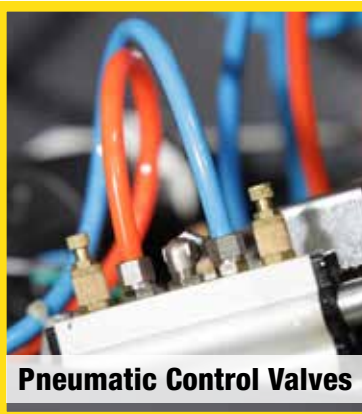
Pneumatic Control Valves

All moving parts feature maintenance-free linear guide bearings for easy adjustment of both vertical and horizontal wheel settings. The non-flex horizontal arm also features a hardened lower roller guide for smooth and controlled in-and-out movement. Integrated rubber bump-stops ensure smooth return during tilt-back operations to help reduce shock loading and minimize wear on tower guides and moving parts.