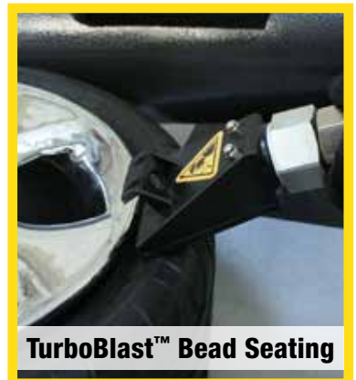
TurboBlast™ Bead Seating