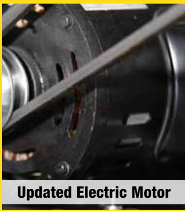
Updated Electric Motor

A maintenance-free gearbox features a large oil and grease reservoir that helps provide efficient heat dissipation and improved lubrication for longer service life. Internal baffles and a constant-seating stress flange gasket ensure positive, leak-free venting. The rugged gearbox enclosure is precision-milled for precise alignment of horizontal and vertical bases and features precision helical gears that operate much more smoothly and quietly than typical spur gear transmissions. The rugged housing provides maximum strength for extreme durability under hard working conditions and greater precision under load during worm and gear alignment.