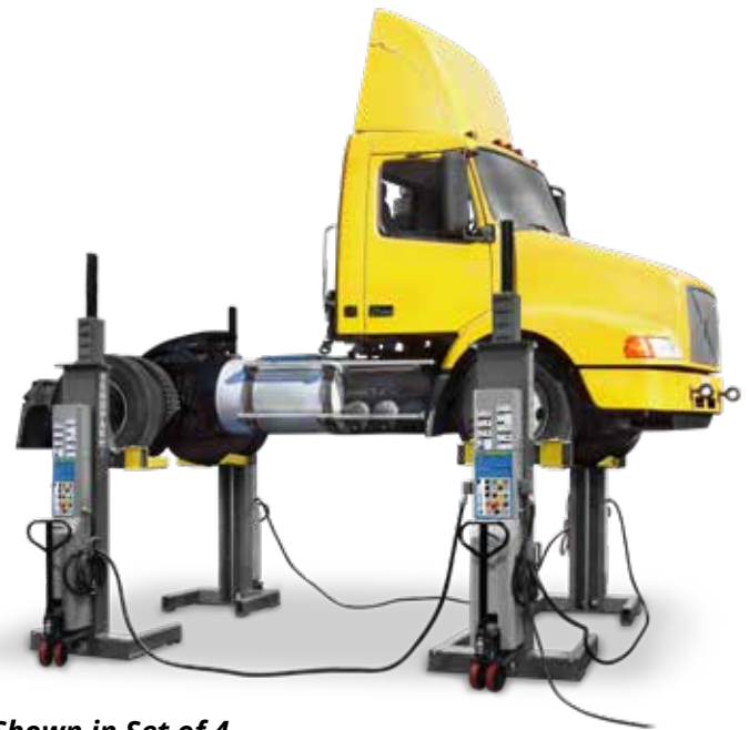
Shown in Set of 4