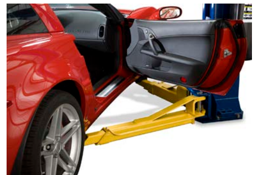
Lift arms shown with optional foot guards