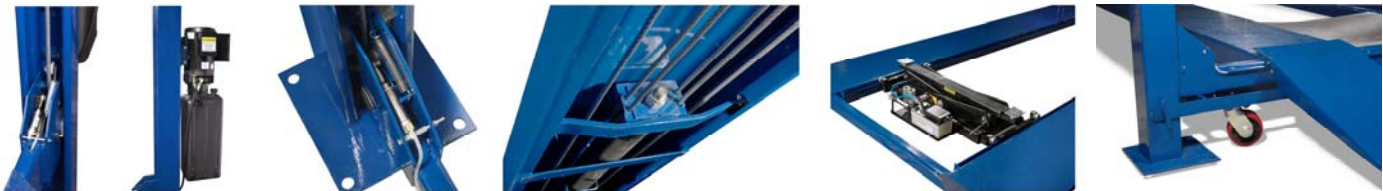
Optional RJ-45 Bridge Jack