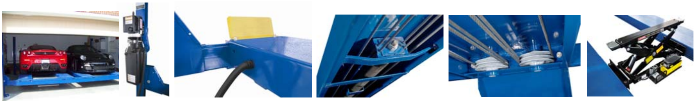
Optional RJ-45 Bridge Jacks

Designed into every HD-Series lift is a laundry list of features as long as your arm to ensure that BendPak is the absolute best you can buy. We design our lifts with the attributes we feel should come standard with every lift. You can always count on BendPak lifts for increased durability, safety and productivity. Spend less time worrying about what you're working under and more time doing what you love. Our commercial-grade lifts are second to none and recognized the world-over as benchmarks of dependability and quality.