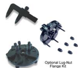
Optional Lug-Nut Flange Kit

Essential for the more precise balancing, this adjustable multi-position flange plate kit includes centering pin adapters to fit most import and domestic car and light truck lug-bolt patterns. The specially designed lug-bolt adaptors balance wheels far more accurately than a cone can do by itself, resulting in a smooth, vibration free drive. Includes flange plate kit and measuring caliper.